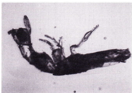
Fig. 5. One of many springtails collected from scalp lesions of JH. The tail of that specimen was broken off; magnification 100X.